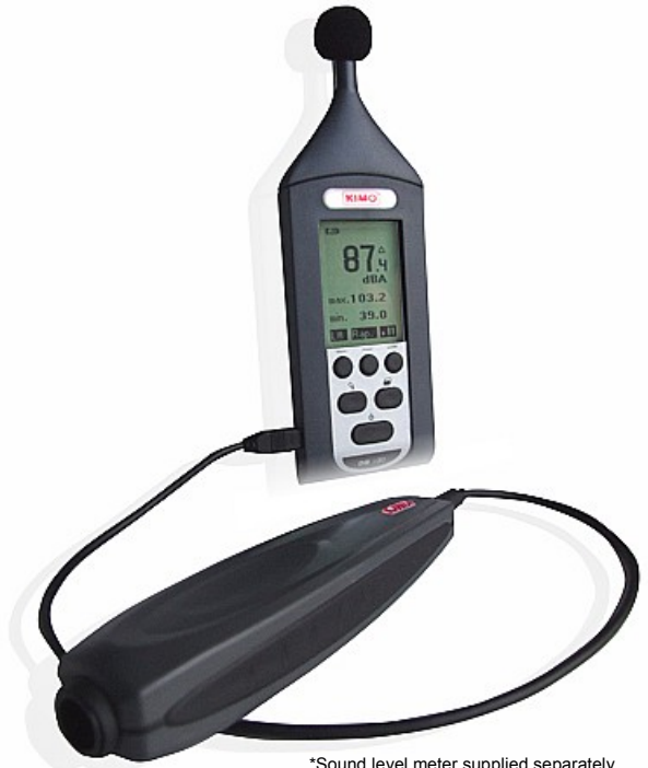
*Sound level meter supplied separately