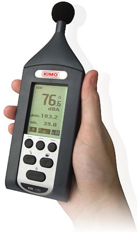
*Livré avec écran anti-vent